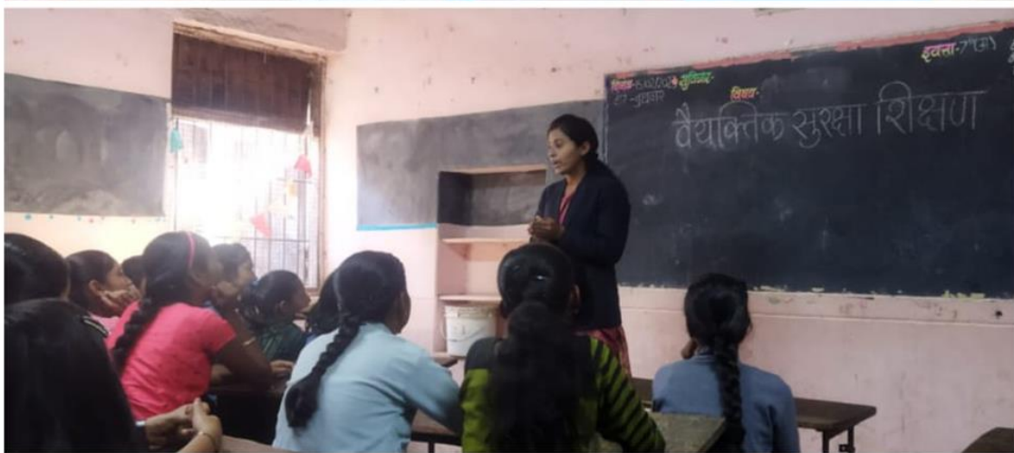
Ambassadors organizing Child Sexual Abuse Prevention Workshops in respected Schools 12 th to 20 th Feb.2023